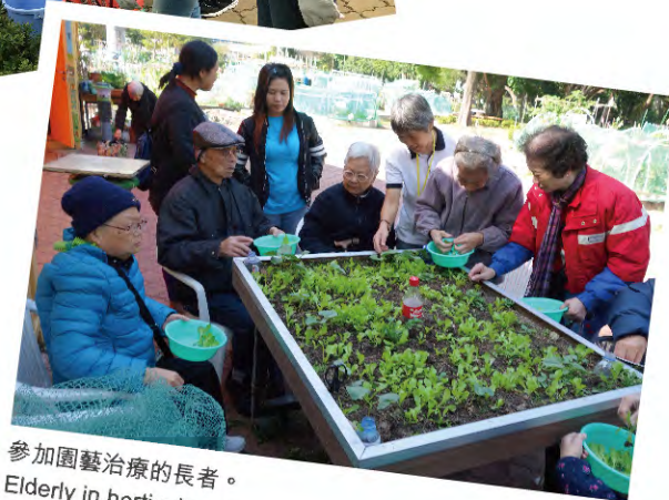
參加園藝治療的長者。 Elderly in horticultural therapy group.