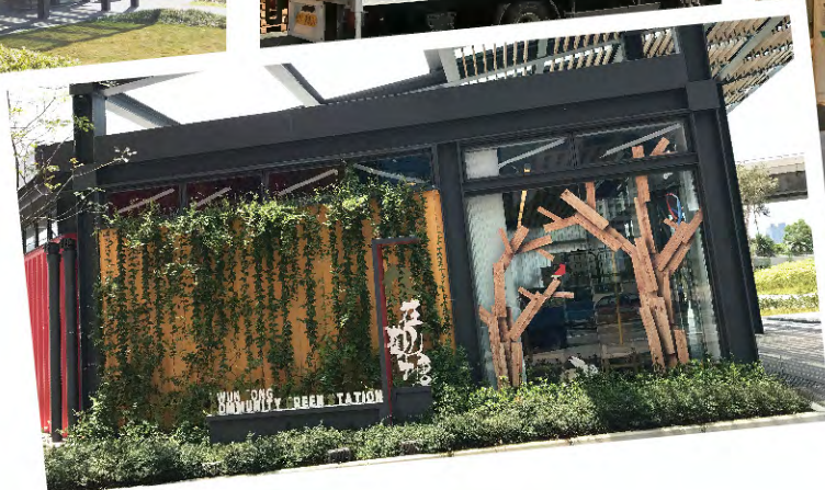
綠在觀塘新貌 The new look of Kwun Tong Community Green Station