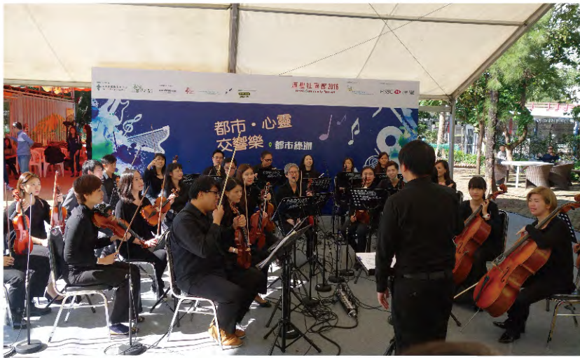
都市·心靈交響樂 Symphony Programme Show