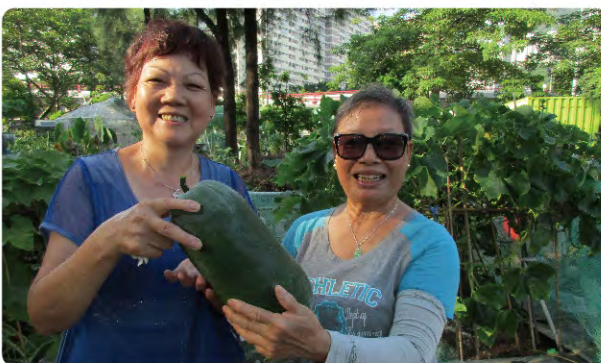
有機農夫互相分享收成的喜悅。 Urban farmers sharing their joy of harvest.

2016年10月開始每月舉辦「有機農墟@都市綠洲」，讓本地有機農夫售賣公平貿易及有機產品，藉此支持本地有機耕種和推動本地有機飲食，去年參加人次超過11,000。此外亦積極舉辦社區活動，讓更多人分享使用這片土地鬆弛身心，例如舉辦「都市·心靈交響樂」，邀請本地交響樂團親自到來演出，讓超過500位市民在柔和的大自然陽光下享受悠揚樂聲。我們亦響應漁農自然護理署的「生物多樣性節」，成為合作伙伴，一起推動本地有機食物。