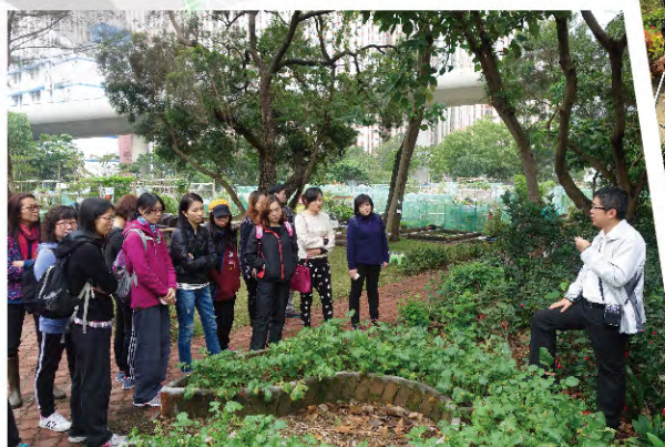
向參觀市民講解都市綠洲的理念。 Introduce Urban Oasis to the public.