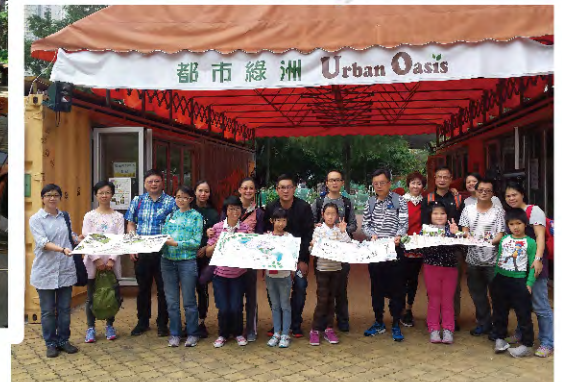
都市綠洲定期舉辦不同的工作坊。 Urban Oasis organised different workshops regularly.